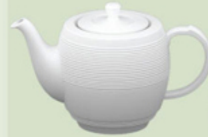
COFFEE POT WITH LID M 0318/L 0.5 ltr.(17.60 oz.)