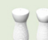
SALT SHAKER M 0344 4.0 X 4.0 X 8.0 cm. (1 1/2" x 1 1/2" x 3 1/8") 62 g. PEPPER SHAKER M 0345 4.0 X 4.0 X 8.0 cm. (1 1/2" x 1 1/2" x 3 1/8") 69 g.