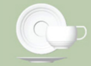
*ESPRESSO CUP M 0349 0.10 ltr.(3.52 oz.) 100 g. *SAUCER M 0351 12.0 cm.(4 3/4") 107 g.