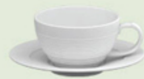
TEA CUP M 0311 0.23 ltr.(8.09 oz.) 180 g. SAUCER M 0313 15.0 cm.(5 7/8") 176 g.