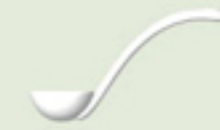
SPICE SPOON M 0335 2.5x8.0 cm.(1" x 3 1/8")