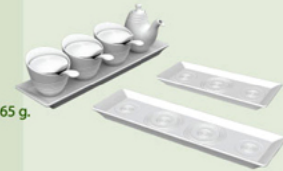
CONDIMENT TRAY M 0334 8.5 X 22.5 cm. (3 3/8" x 8 7/8") M 0333 8.5 X 30.0 cm. (3 3/8" x 11")