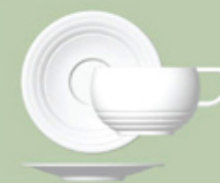
*TEA CUP M 0347 0.22 ltr.(7.74 oz.) 200 g. *SAUCER M 0348 15.0 cm.(5 7/8") 175 g.