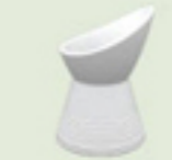
EGG CUP & TOOTHPICK HOLDER M 0346 5.0 X 5.0 X 7.5 cm. (2" x 2" x 3") 69 g.