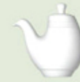
VINEGAR / SOYA SAUCE POT M 0336/L 0.10 ltr.(3.52 oz.)