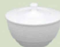
SUGAR BOWL WITH LID M 0320/L 10.50 cm.(4 1/8") 317 g.