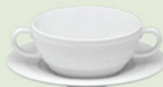
SOUP CUP 2 HDLS. M 0316 0.30 ltr.(10.56 oz.) 210 g. SAUCER M 0317 16.0 cm.(6 1/4") M 0313 15.0 cm.(5 7/8") 176 g.