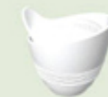
CONDIMENT BOWL M 0332/L 0.06 ltr.(2.11 oz.)