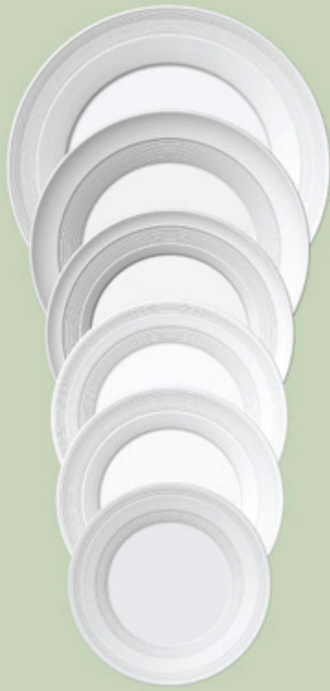
FLAT PLATTER M 0307 31.0 cm.(12 1/4") 1,084 g.