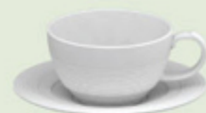
CAPPUCINO CUP M 0312 0.28 ltr.(9.85 oz.) 197 g. SAUCER M 0317 16.0 cm.(6 1/4")