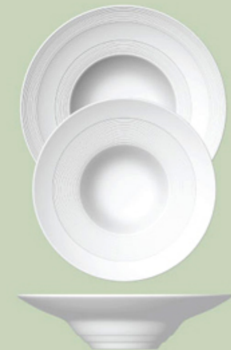
SOUP PLATE M 0306 22.5 cm.(8 7/8") 550 g.