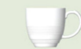
MUG M 0352 0.385 ltr.(13.55 oz.) 310 g.