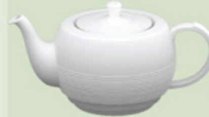
TEA POT WITH LID M 0319/L 0.6 ltr.(21.12 oz.) 465 g.