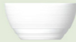
NOODLE BOWL M 0325 17.0 cm.(6 3/4") 629 g.