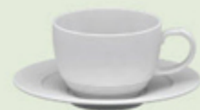
COFFEE CUP M 0310 0.24 ltr.(8.44 oz.) 181 g. SAUCER M 0313 15.0 cm.(5 7/8") 176 g.