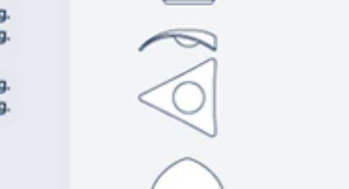
PEPPER SHAKER N 2932 7.0 cm. (2 3/4") 73 g.