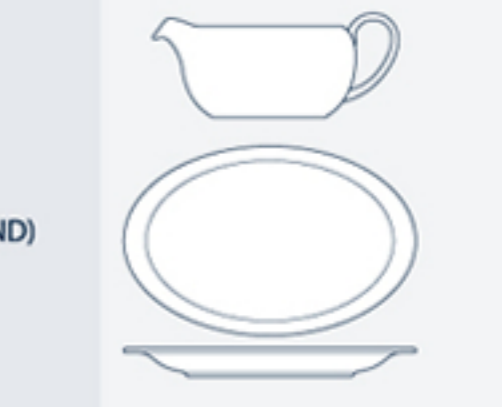
GRAVY BOAT N 2927 0.45 ltr. (15.84 oz.) 302 g.