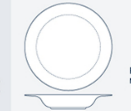
ROUND SOUP PLATE N 2944 Ø 20.0 cm. (7 7/8") 295 g.