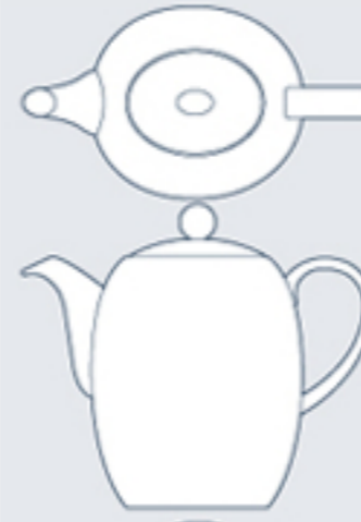
COFFEE POT WITH LID N 2917/L 1.46 ltr. (51.39 oz.) 717 g.