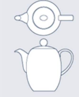
COFFEE POT WITH LID (ROUND) N 2973/L 0.70 ltr. (24.6 oz.) 439 g. N 2974/L 0.34 ltr. (11.9 oz.) 254 g.