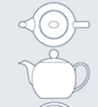
TEA POT WITH LID (ROUND) N 2975/L 0.75 ltr. (26.4 oz.) 468 g. N 2976/L 0.45 ltr. (15.8 oz.) 330 g.