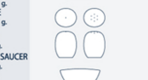
SALT SHAKER N 2931 7.0 cm. (2 3/4") 73 g.