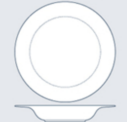
PASTA PLATE N 2963 31.0 cm. (12 1/4") 857 g. N 2964 26.0 cm. (10 1/4") 617 g.