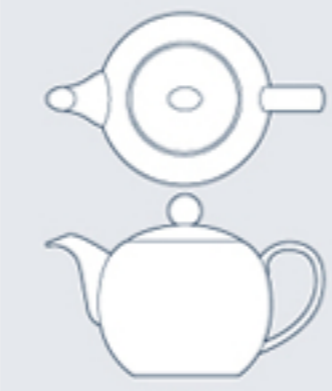
TEA POT WITH LID N 2918/L 1.5 ltr. (52.8 oz.) 743 g.