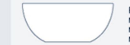
ROUND SALAD BOWL N 2965 Ø 23.0 cm. (9 1/8") 938 g. N 2966 Ø 19.0 cm. (7 1/2") 580 g. N 2967 Ø 17.5 cm. (6 7/8") 420 g.