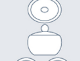
SUGAR BOWL WITH LID N 2920/L 0.31 ltr. (10.91 oz.) 246 g.