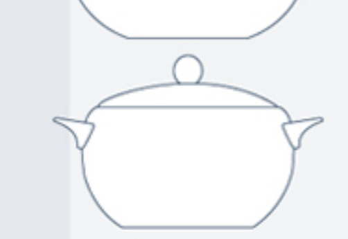
SOUP TUREEN WITH LID N 2925/L 3.5 ltr. (123.2 oz.) 1,527 g.