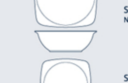
SQUARE FRUIT BOWL N 2991 13.0 cm. (5 1/8") 200 g.