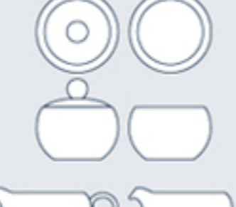
SUGAR BOWL WITH LID (ROUND) N 2980/L 0.22 ltr. (7.74 oz.) 194 g. OPEN SUGAR BOWL (ROUND) N 2981 0.20 ltr. (7.0 oz.) 142 g.