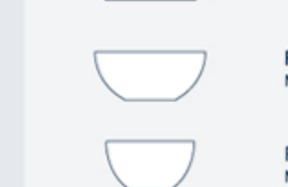
FRUIT BOWL N 2924 Ø 12.5 cm. (4 7/8") 190 g.