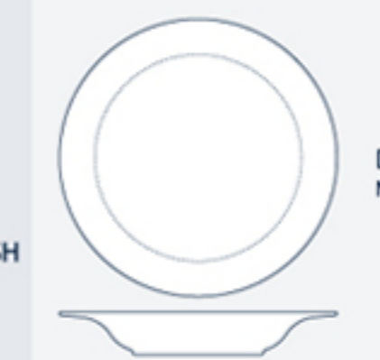
DEEP PLATE N 2906 Ø 24.5 cm. (9 5/8") 500 g.