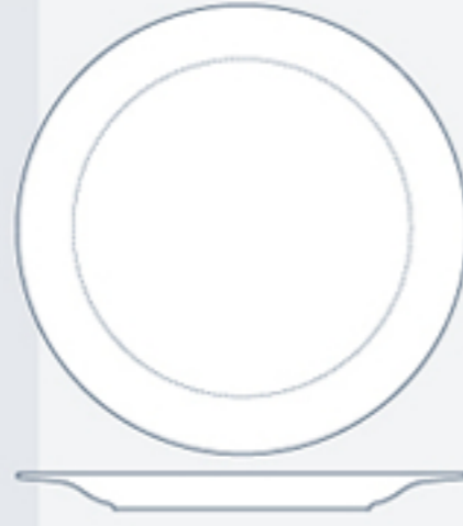
ROUND FLAT PLATTER N 2907 Ø 32.5 cm. (12 3/4") 752 g.