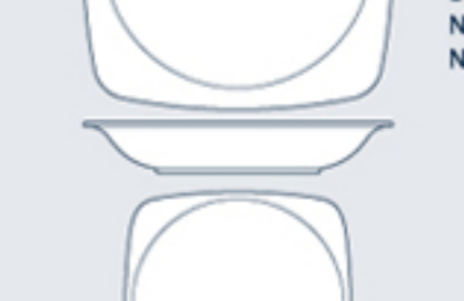
SQUARE CEREAL BOWL N 2968 16 cm. (6 1/4") 304 g.