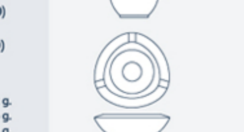
ASHTRAY N 2986 12.0 cm. (4 3/4") 152 g.