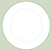
FLAT PLATE M 9801 Ø 27.0 cm. (10 5/8") 681 g. M 9802 Ø 25.0 cm. (9 7/8") 523 g. M 9803 Ø 23.0 cm. (9 1/8") 437 g. M 9804 Ø 21.0 cm. (8 1/4") 381 g. M 9805 Ø 18.5 cm. (7 1/4") 299 g. M 9806 Ø 16.5 cm. (6 1/2") 220 g.