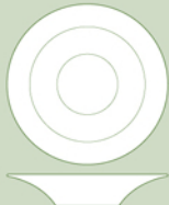
SOUP PLATE M 9807 Ø 24.0 cm. (9 1/2") 533 g.