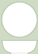
BOWL M 9841 Ø 20.5 cm. (8 1/8") 733 g. M 9842 Ø 17.0 cm. (6 3/4") 435 g. M 9843 Ø 15.0 cm. (5 7/8") 357 g. M 9844 Ø 13.0 cm. (5 1/8") 227 g.