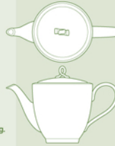
COFFEE & TEA POT WITH LID M 9813/L 1.32 ltr. (46.46 oz.) 881 g.