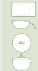
SUGAR BOWL WITH LID M 9817 0.25 ltr. (8.80 oz.) 318 g.