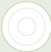
ENTREE BOWL M 9838 1.20 ltr. (42.24 oz.) Ø 27.0 cm. (10 5/8") 949 g.