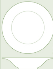
PASTA BOWL M 9837 Ø 30.0 cm. (11 7/8") 1,039 g.