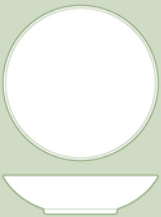
SOUP BOWL M 9808 Ø 20.5 cm. (8 1/8") 540 g.