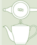
COFFEE POT WITH LID M 9814/L 0.65 ltr. (22.88 oz.) 522 g.