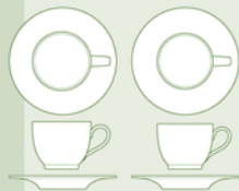
COFFEE CUP NON STACK M 9821 0.25 ltr. (8.80 oz.) 212 g. M 9822 0.22 ltr. (7.74 oz.) 191 g. SAUCER M 9824 Ø 16.0 cm. (6 1/4") 205 g.