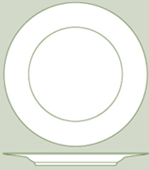
FLAT PLATTER (Wider Rim) P 1061 Ø 31.5 cm. (12 3 / 8 ") 990 g.