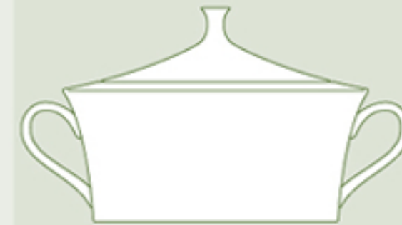
SOUP TUREEN WITH LID P 3549/L. 3.0 ltr. (105.6 oz.) 2,062 g.