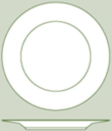
FLAT PLATE (Wider Rim) P 1059 Ø 22.0 cm. (8 5 / 8 ") 410 g.