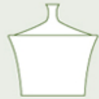
SUGAR BOWL W/LID P 3519/3546L. 0.29 ltr. (10.03 oz.) 240 g.