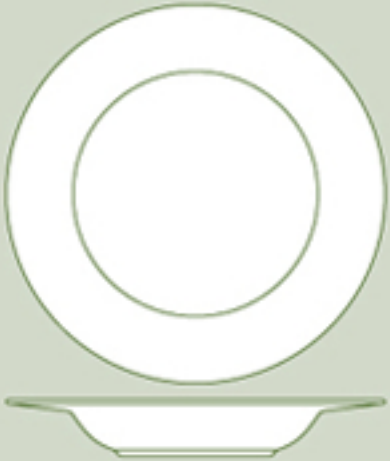
SOUP PLATE (Wider Rim) P 1060 Ø 24.5 cm. (9 5 / 8 ") 570 g.