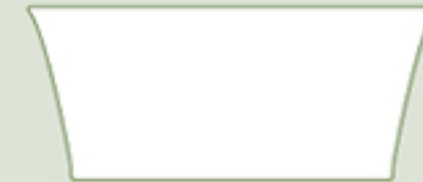
SALAD BOWL P 3523 Ø 23.0 cm. (9 1 / 8 ") 1,074 g. P 3524 Ø 20.0 cm. (7 7 / 8 ") 744 g. P 3525 Ø 16.0 cm. (6 1 / 4 ") 333 g. P 3545 Ø 18.5 cm. (7 1 / 4 ") 600 g.