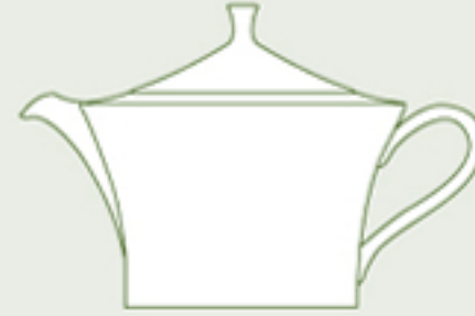
TEA POT W/LID P 3548/L. 1.10 ltr. (38.72 oz.) 717 g.