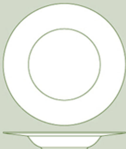
PASTA PLATE (Wider Rim) P 1062 Ø 26.5 cm. (10 3 / 8 ") 650 g.