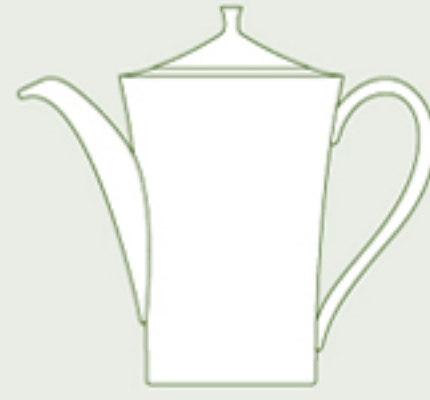
COFFEE POT W/LID P 3547/L. 1.10 ltr. (38.72 oz.) 725 g.