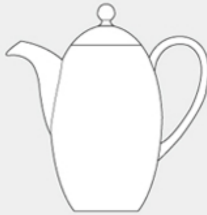
COFFEE POT WITH LID A 0209/L 1.28 ltr. (45.05 oz.) 691 g.