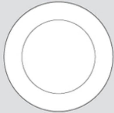
FLAT PLATE A 02/0101 Ø 27.5 cm. (10 7/8") 560 g. A 02/0102 Ø 21.5 cm. (8 1/2") 270 g. A 02/0103 Ø 17.5 cm. (6 7/8") 172 g.