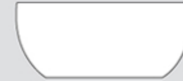
SALAD BOWL A0215 Ø 24.0 cm. (9 1/2") 1,128 g. A0216 Ø 20.5 cm. (8 1/8") 743 g. A0217 Ø 15.5 cm. (6 1/8") 388 g.