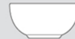
RICE BOWL A 0223 Ø 15.5 cm. (6 1/8") 318 g. A 0224 Ø 10.0 cm. (3 7/8") 124 g.