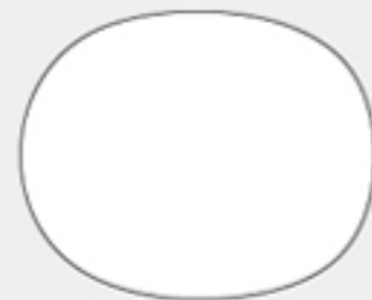
GRAVY BOAT A 0218 0.42 ltr. (14.78 oz.) 240 g. GRAVY BOAT STAND A 0219 16.0 x 20.0 cm. (6 1/4" x 8") 276 g.