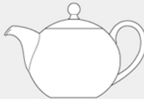
TEA POT WITH LID A 0210/L 1.28 ltr. (45.05 oz.) 660 g.