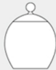
SUGAR BOWL WITH LID A 0211/L 0.35 ltr. (12.32 oz.) 233 g.