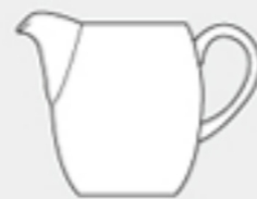
CREAMER A 0212 0.25 ltr. (8.8 oz.) 191 g.