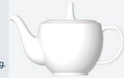
COFFEE/TEA POT WITH LID N 6823/L 0.4 ltr.