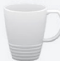
MUG N 6839 0.38 ltr. (13.37 oz.)