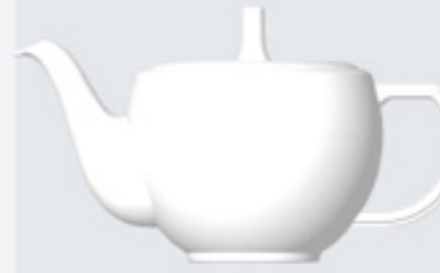
TEA POT WITH LID N 6822/L 0.6 ltr.(21.12 oz.) 430 g.