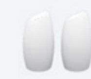
SALT SHAKER N 6835 3.5 X 4.0 X 7.5 cm. (1 3/8" X 1 5/8" X 3") 60 g. PEPPER SHAKER N 6836 3.5 X 4.0 X 7.5 cm. (1 3/8" X 1 5/8" X 3") 60 g.