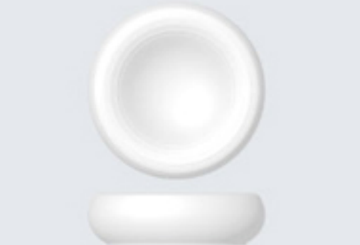
GOURMET BOWL N 6842 20.0 cm. (7 7/8")