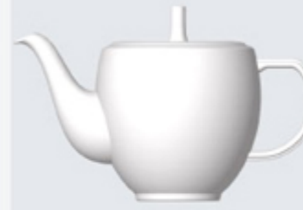
COFFEE/TEA POT WITH LID N 6840/L 1.1 ltr.(38.72 oz.)