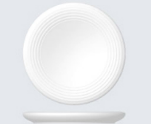
GOURMET PLATE N 6841 28.0 cm. (11 1/8")