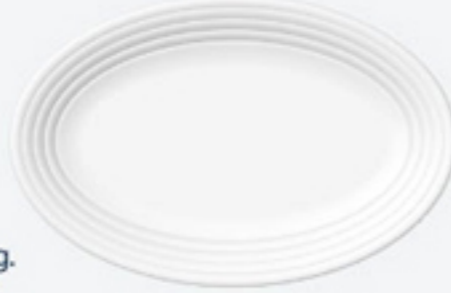
OVAL PLATE N 6812 19.5 X 30.0 cm. (7 5/8" X 11 7/8") 444 g. N 6813 17.5 X 27.0 cm. (6 7/8" X 10 5/8") 398 g.