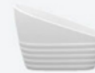
SUGAR PACK HOLDER N 6825 5.0 X 11.5 X 7.0 cm. (2" X 4 1/2" X 2 3/4") 156 g.