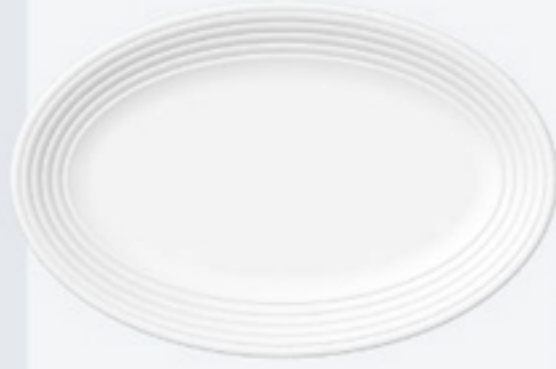
OVAL PLATTER N 6809 26.0 X 40.0 cm. (10 1/4" X 15 3/4") N 6810 22.0 X 35.0 cm. (8 5/8" X 13 3/4") 650 g. N 6811 21.0 X 32.0 cm. (8 1/4" X 12 5/8") 649 g.