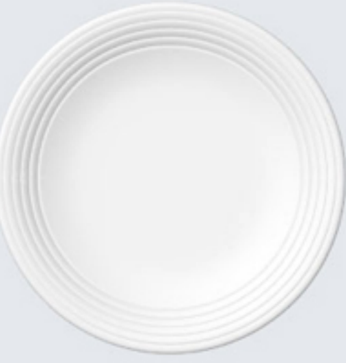
FLAT PLATTER N 6807 31.0 cm. (12 1/4") 822 g.