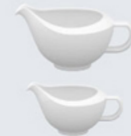
CRAEMER N 6826 0.18 ltr.(6.33 oz.) 133 g. N 6827 0.10 ltr.(3.52 oz.) 95 g.