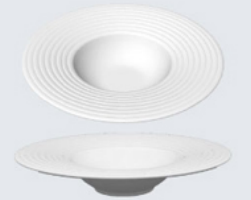
PASTA PLATE N 6808 28.0 cm. (11 1/8") 652 g.