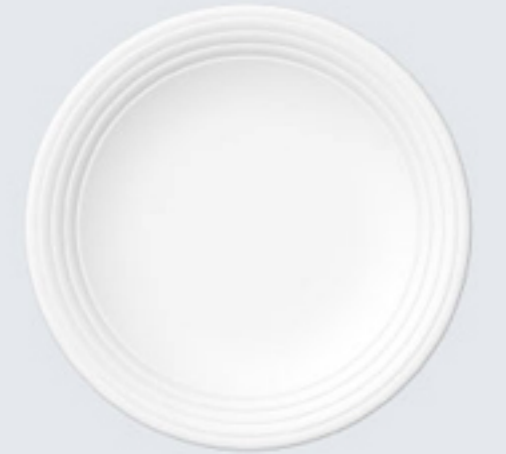
FLAT PLATE N 6801 27.0 cm.(10 5/8") 548 g. N 6802 24.0 cm.(9 1/2") 499 g. N 6803 21.0 cm.(8 1/4") 361 g. N 6804 18.0 cm.(7 1/8") N 6805 16.0 cm.(6 1/4") 169 g.