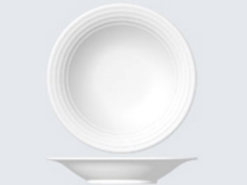
SOUP PLATE N 6806 23.5 cm. (9 1/4") 460 g.