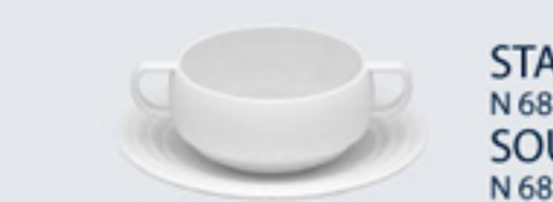
STACKING SOUP CUP N 6819 0.30 ltr.(10.56 oz.) SOUP CUP SAUCER N 6820 16.0 cm.(6 1/4") 194 g.