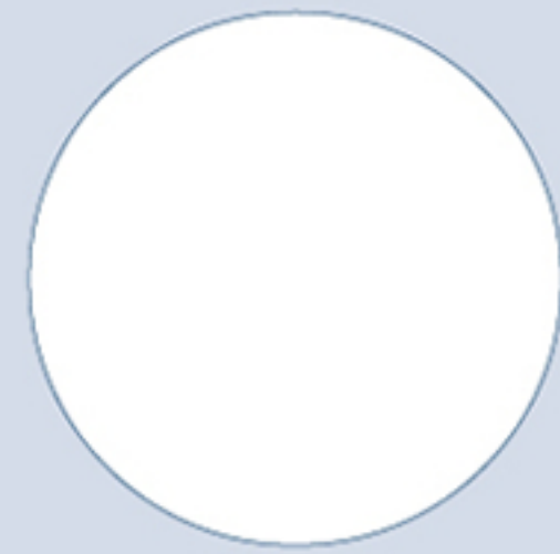
FLAT PLATTER N 4905 33.0 cm.(13") 992 g.