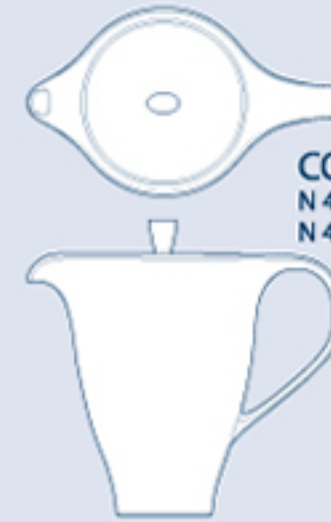
COFFEE POT WITH LID N 4917/L 1.30 ltr. (45.76 oz.) 783 g. N 4932/L 0.33 ltr. (11.61 oz.) 344 g.