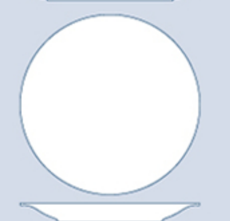
FLAT PLATE N 4937 25.0 cm.(9 7/8") 449 g.