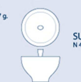
SUGAR BOWL WITH LID N 4916/L 0.31 ltr. (10.91 oz.) 264 g.