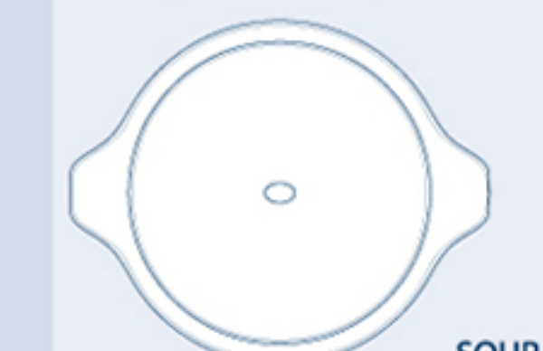
SOUP TUREEN WITH LID N 4919/L 4.0 ltr. (140.80 oz.) 1,967 g.