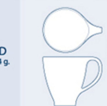
MUG N 49/4123 0.35 ltr. (12.32 oz.) 235 g.