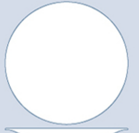
FLAT PLATE N 4933 28.5 cm.(11 1/4") 630 g.