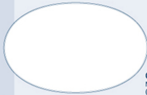
OVAL DEEP BOWL N 4908 27.0 X 41.0 cm. (10 5/8" X 16 1/8") 1,290 g.