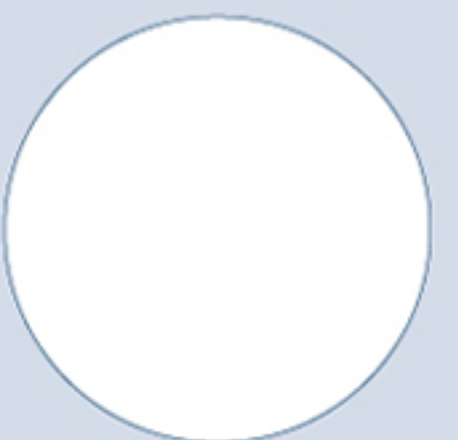
PASTA PLATE N 4907 30.0 cm.(11") 843 g.