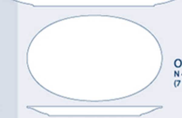
OVAL PLATE N 4911 18.0 X 28.0 cm. (7 1/8" X 11") 393 g.