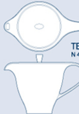
TEA POT WITH LID N 4918/L 1.28 ltr. (45.06 oz.) 810 g.