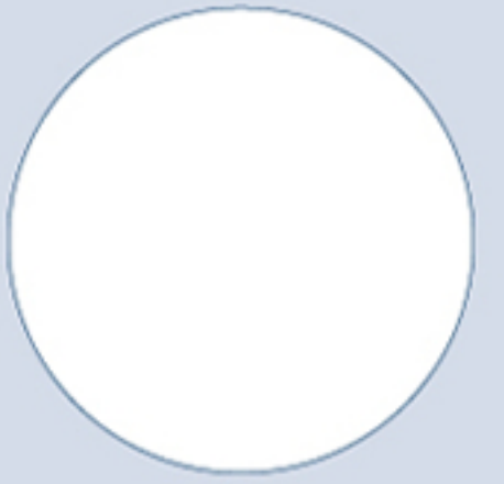
FLAT PLATE N 4901 29.5 cm.(11 5/8") 643 g. N 4902 26.0 cm.(10 1/4") 509 g. N 4903 22.5 cm.(8 7/8") 379 g. N 4904 18.0 cm.(7 1/8") 240 g.