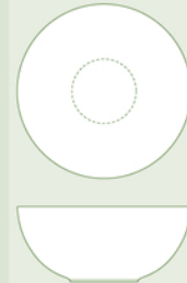
SALAD BOWL M 6315 Ø 24.0 cm. (9 1 / 2 ") 1,230 g. M 6316 Ø 21.0 cm. (8 1 / 4 ") 928 g. NOODLE BOWL M 6317 Ø 17.0 cm. (6 3 / 4 ") 609 g.