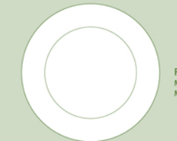
FLAT PLATE M 9022 Ø 26.0 cm. (10 1 / 4 ") 710 g. M 9023 Ø 24.0 cm. (9 1 / 2 ") 612 g.