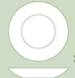
PASTA PLATE M 6338 Ø 29.0 cm. (11 3 / 8 ") 1,159 g.