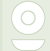
CEREAL BOWL M 6318 Ø 15.0 cm. (5 7 / 8 ") 33.5 g.