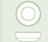
BOWL STACKABLE M 6345 Ø 11.5 cm. (4 1 / 2 ") 235 g.