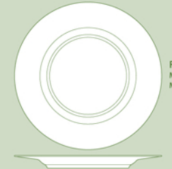
FLAT PLATE (Wider Rim) M 9036 Ø 28.5 cm. (11 1 / 4 ") 850 g. M 9037 Ø 22.5 cm. (8 7 / 8 ") 393 g.