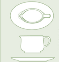
CREAMER (NEW HDL.) / GRAVY BOAT M 6344 0.24 ltr. (8.62 oz.) 205 g. GRAVY BOAT STAND M 6332 12.00 x 18.50 cm. (4 3 / 4 " x 7 1 / 4 ") 170 g.