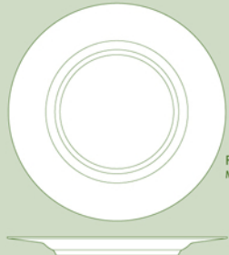
FLAT PLATTER (Wider Rim) M 9038 Ø 31.5 cm. (12 3 / 8 ") 1,084 g.