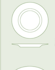
FLAT PLATE M 9043 Ø 16.5 cm. (6 1 / 2 ") 253 g.