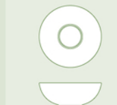
FRUIT BOWL M 6319 Ø 12.0 cm. (4 3 / 4 ") 216 g.