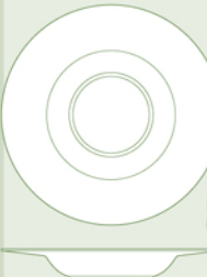
PASTA PLATE (Wider Rim) M 9040 Ø 26.5 cm. (10 3 / 8 ") 723 g.