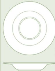
SOUP PLATE (Wider Rim) M 9039 Ø 25.0 cm. (9 7 / 8 ") 635 g.